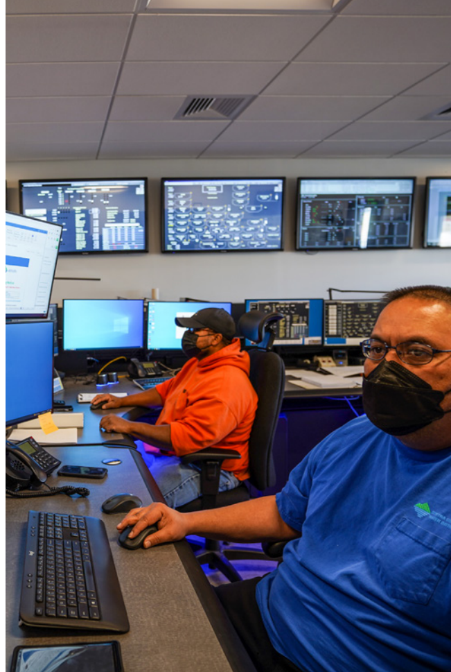
Skilled operators use sophisticated technology to control the systems that treat your drinking water and move it to reach the 500,000 people who depend on it every day.

To find out more about the Lead Sampling of Drinking Water in Schools initiative, visit waterboards.ca.gov/drinking_water/certlic/drinkingwater/leadsamplinginschools.shtml .