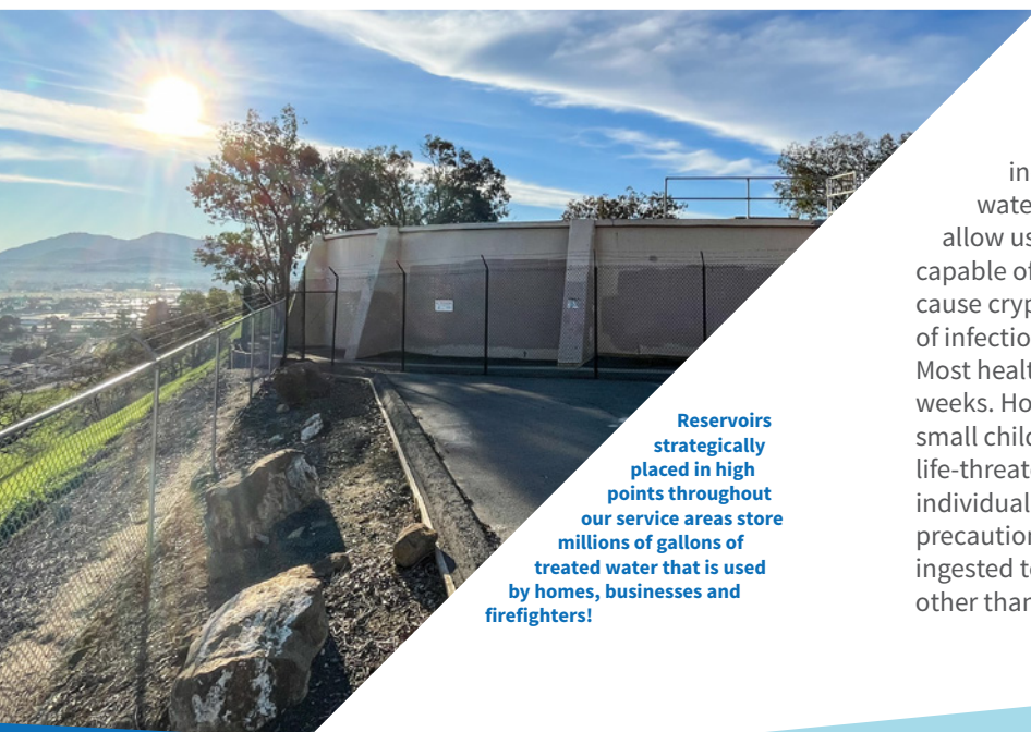
Reservoirs strategically placed in high points throughout our service areas store millions of gallons of treated water that is used by homes, businesses and firefighters!

Cryptosporidium is a microbial pathogen found in surface water throughout the U.S. Although filtration removes Cryptosporidium , the most commonly-used filtration methods cannot guarantee 100 percent removal. Our monitoring indicates the presence of these organisms in our source water and/or finished water. Current test methods do not allow us to determine if the organisms are dead or if they are capable of causing disease. Ingestion of Cryptosporidium may cause cryptosporidiosis, an abdominal infection. Symptoms of infection include nausea, diarrhea, and abdominal cramps. Most healthy individuals can overcome the disease within a few weeks. However, immunocompromised people, infants and small children, and the elderly are at greater risk of developing life-threatening illness. We encourage immunocompromised individuals to consult their doctor regarding appropriate precautions to take to avoid infection. Cryptosporidium must be ingested to cause disease, and it may be spread through means other than drinking water.