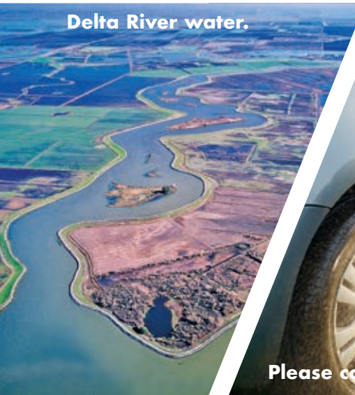
Delta River water.