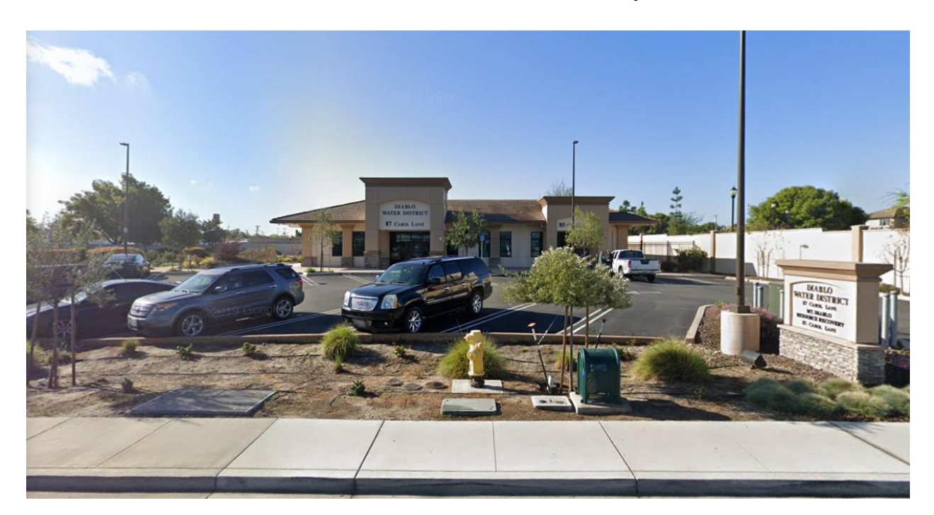
Attachment 2 Administrative Office (87 Carol Lane, Oakley, CA 94561)